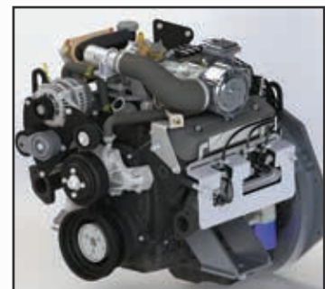
PSI 4.3L engine