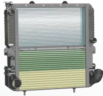
Diesel radiator features air to air intercooler technology