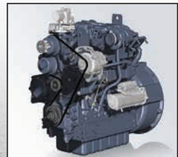
High output Kubota 3.8L turbo diesel engine