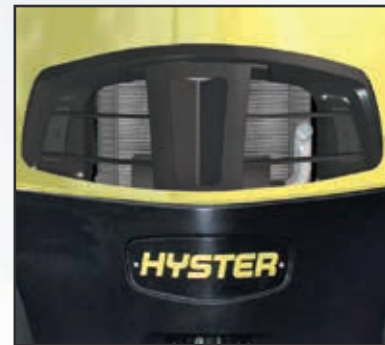
Counterweight tunnel design