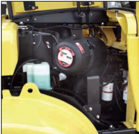
Easy service access